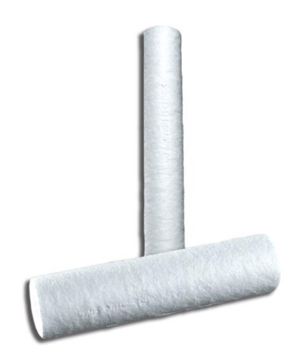
Figure 1: Purtrex Depth Cartridge Filters